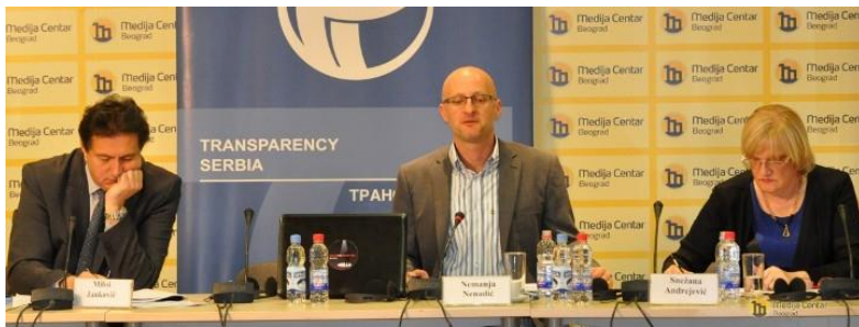
Šta funkcioneri smeju u kampanji (what is allowed for officials during campaign)