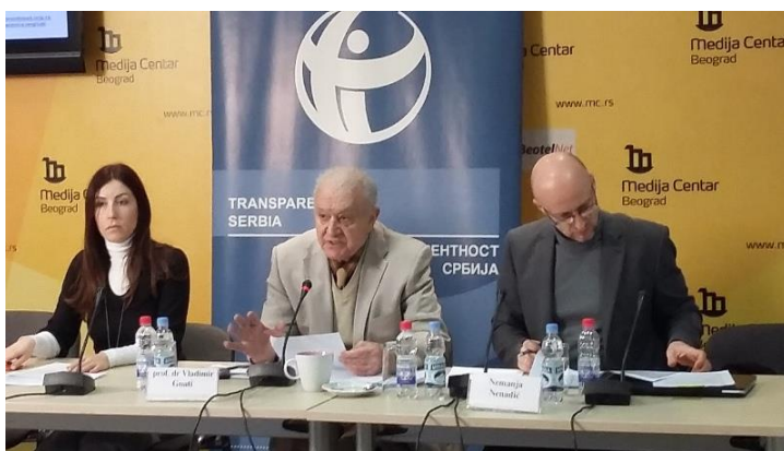
Stagnacija na listi CPI, bez suštinskog napretka u stvarnosti (stagnation in Corruption perception index)